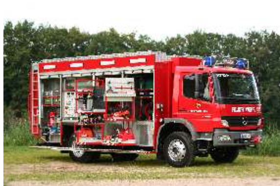
GW / Support Vehicle