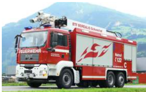
ULF / Industrial FFV 1.000/2.500/1.000 TLA