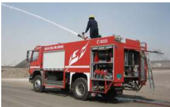
ULF / Industrial FFV 4.000/400/250