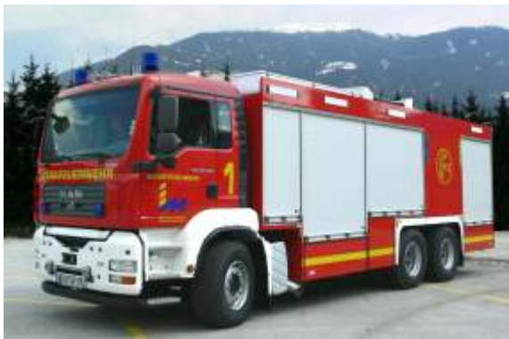
ULF / Industrial FFV 4.000/2.000/1.500/240