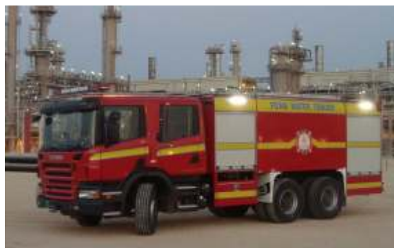
ULF / Industrial FFV 4.000/6.000