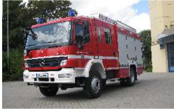
LF 20/16 / Pumper 2.000/100/100