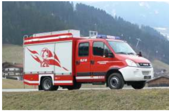
KLF-W / Rapid Intervention Unit with water tank