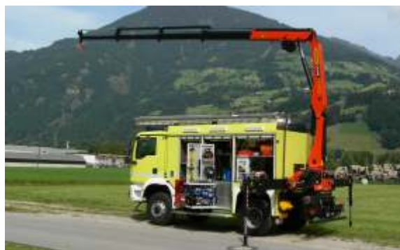
SRF / Heavy Rescue Vehicle with crane