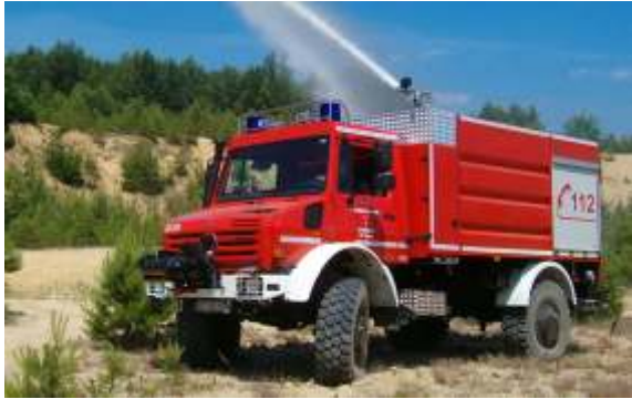
TLF 20/50 / FFV 5.000