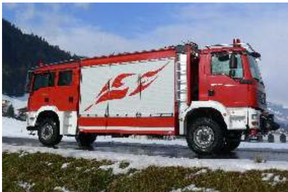
RLF-T / Rescue Pumper for tunnels