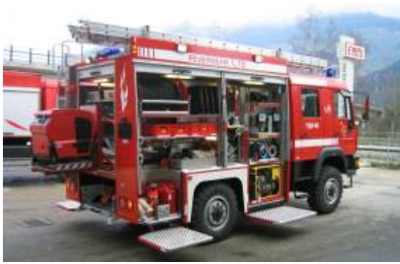
TSF-W / Rapid Intervention Unit with water tank