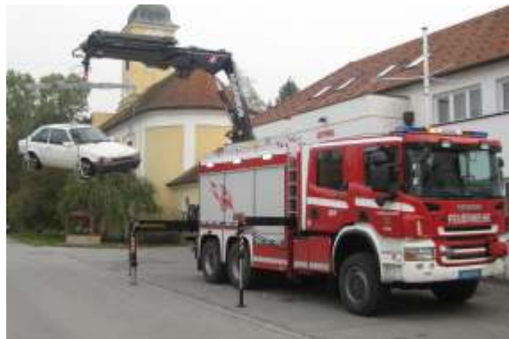
SRF / Heavy Rescue Vehicle with crane