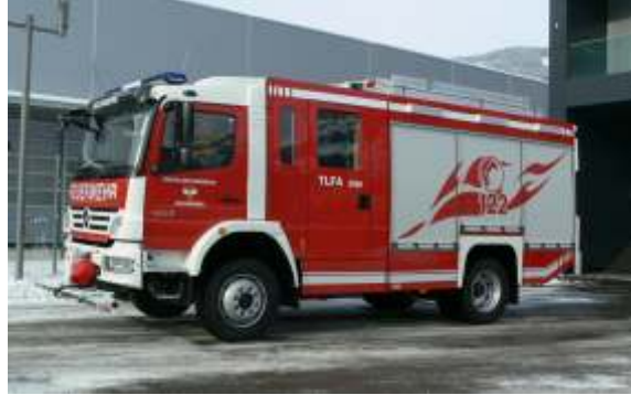
TLF-A / Pumper 2.000