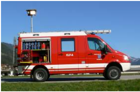
KLF / Rapid Intervention Unit