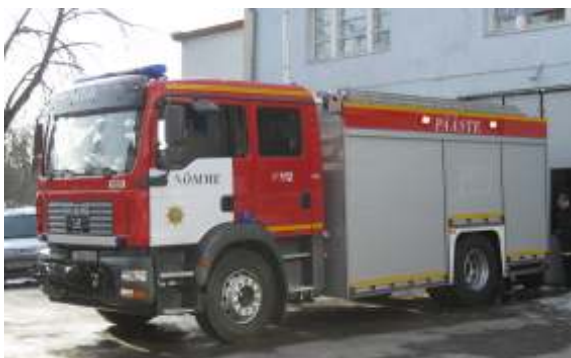
HLF / Rescue Pumper 3.000/200/50