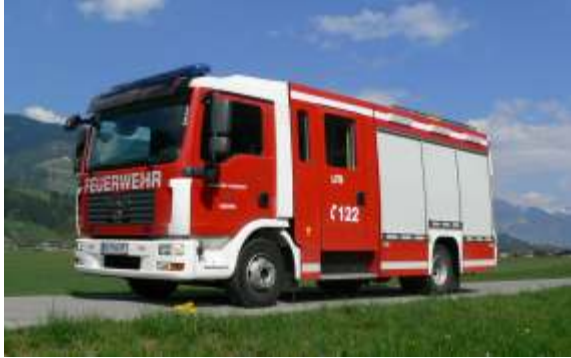
LFB / Medium Intervention Unit