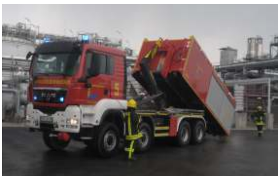
WLF / Load Handling System