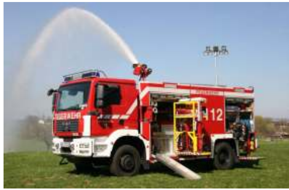
TLF 20/40 / Pumper 4.000/500/100