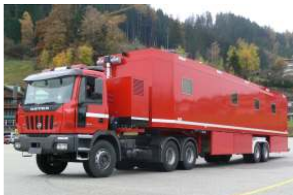
Kommandosattel / Command Unit