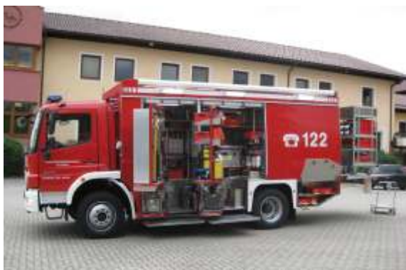
GSF-A / Hazardous Material Vehicle